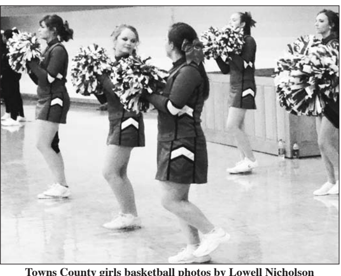
Towns County girls basketball